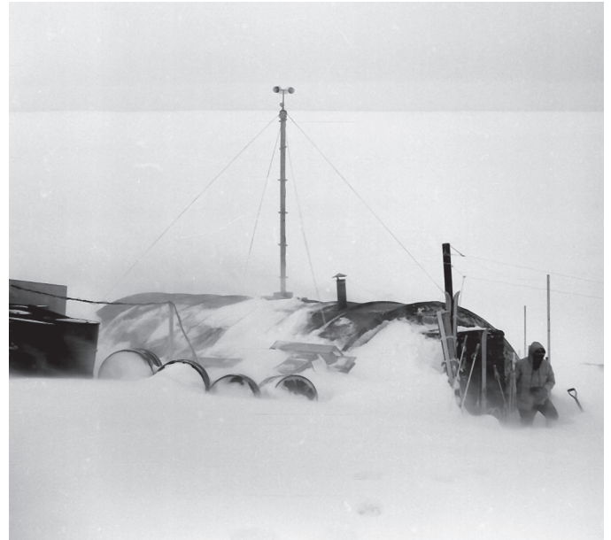
FIG 2. A) A supercub unloads people and supplies in the upper cirque of McCall Glacier, with the IGY camp in the background. B) Main IGY camp on McCall Glacier after a blizzard.

glacier a length of approximately 20 km where it joined a glacier that used to fill the Jago River valley, compared with its 1957 length of about 8 km. Mason studied ice temperatures and heat flux in the upper cirque of McCall Glacier, in a borehole drilled down to 90 m. While the upper 15 m showed strong seasonal variations, below that level the temperature was fairly constant, with a value close to -1^{\circ}\text{C} , because of surface meltwater that percolated into the cold firn and refroze, releasing its latent heat. Keeler also reported on the ablation on the lower McCall for the summer of 1957. He provided an ablation map for the glacier and discussed the snow cover and superimposed ice. He found that the ablation rates were 2–3 cm/day: surprisingly, not much less than on the Blue Glacier in Washington State. These began the first comprehensive measurements of ablation on a glacier in the U.S. Arctic, although there was work on a small glacier on nearby Mt. Michelson at the same time, and Leffingwell had studied Okpilak Glacier briefly in 1906.