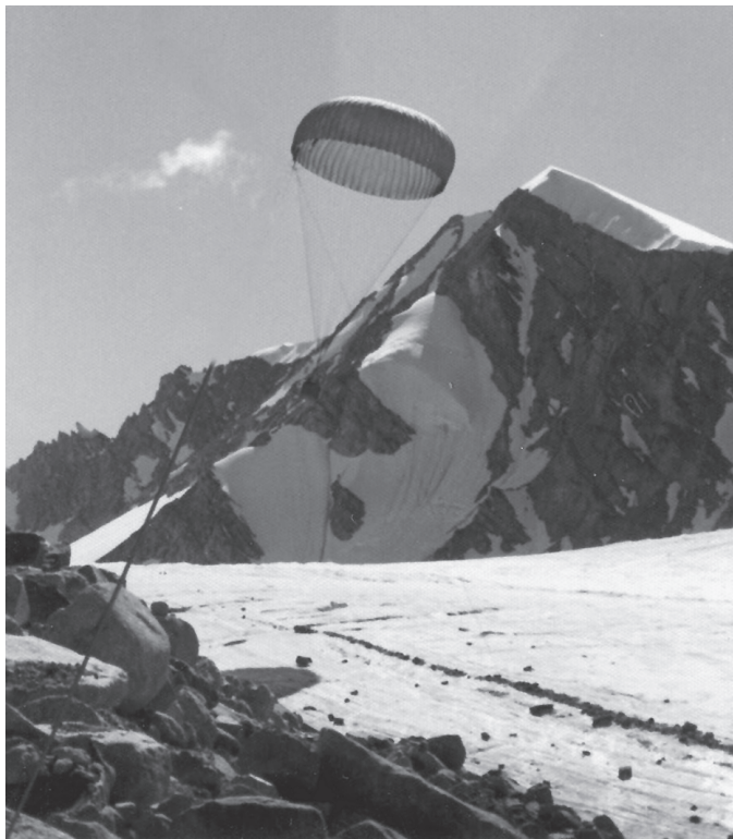
FIG. 4. Parachutes dropped from a NARL R4D supplied the researchers on the glacier with food and fuel in the 1970s.

and fuel from their R4D aircraft during the four-year operation of the project (Fig. 4), and Cessna flights to take people in and out from the glacier, usually by floatplane from Jago Lake, when it was not possible to land on the glacier itself.