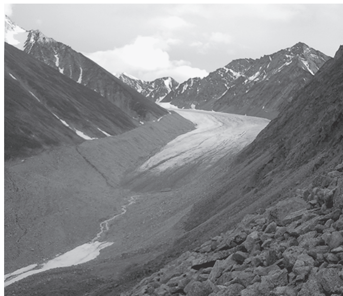
FIG. 6. Comparison of the McCall Glacier terminus in 1958 and in 2003.

often used public legacy of their project—the second photo of the pair shown in Figure 6, which has been reproduced widely and is becoming an icon of Arctic climate change.